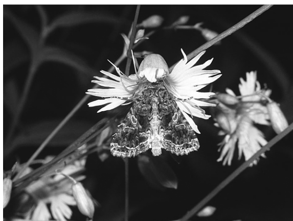
PLATE 1. (Top to bottom) Bombus sp. visiting Silene caroliniana , Ruby-throated Hummingbird visiting Silene virginica , and Hadena ectypa visiting Silene stellata .

of the principal pollinators as defined by the detailed study of the pollination systems. It is unlikely that asynchronous visitor activity and plant flowering, sampling artifacts, and plant isolation (which may occur if plant populations were located on the edge of their species range) have caused the appearance of specialized pollination systems. For one, large bees visit S.